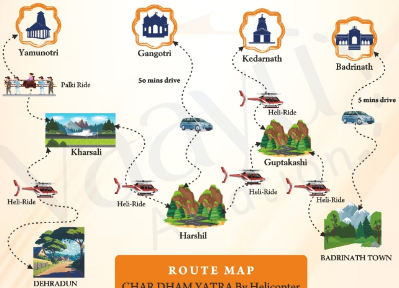
ROUTE MAP CHAR DHAM YATRA By Helicopter

Chardham Yatra tour ends here but memories build with Leisure India Holidays remains forever!